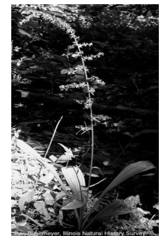
False Hellebore