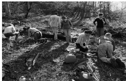
PAC & Carolina Mountain Land Conservancy teamed up to remove Kudzu on PAC's Norman Wilder Forest Preserve. PAC is so thankful for the additional help!