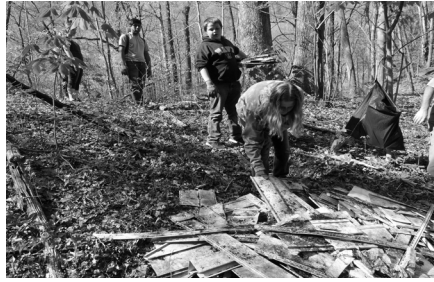
Hands of Change Youth Service Group partnered with PAC to remove trash & litter from a PAC owned property/preserve. The group did a great job & made a huge difference!