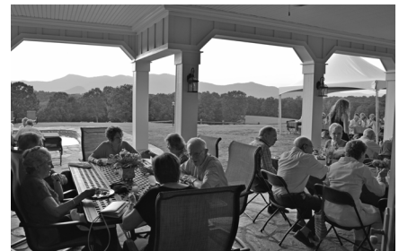
Guests enjoying the delicious meal & spectacular view.