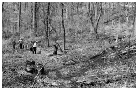
Boy Scout Troop 150 worked with PAC to pull English Ivy (& other non-native & invasive plants) from the PAC protected Norman Wilder Forest! This was a service project for the Boy Scouts, & PAC is so grateful for their help!