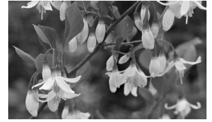
American Snowbell